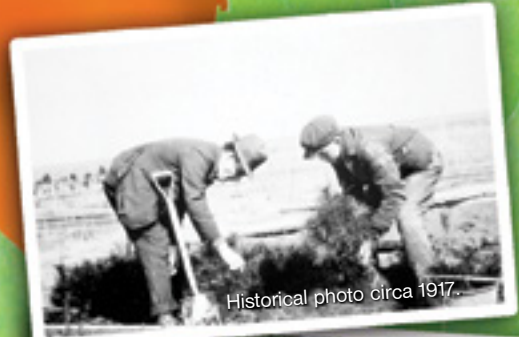
Historical photo circa 1917.

Discover a vibrant collection of creatures, spaces to celebrate, magnificent gardens to stroll and a site steeped in history. Find yourself at the Saskatoon Forestry Farm Park & Zoo.