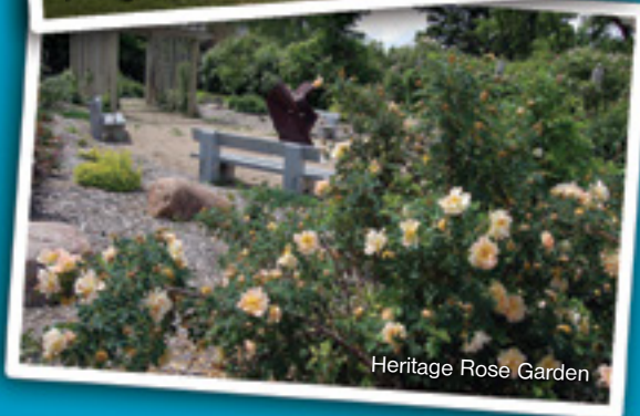
Heritage Rose Garden