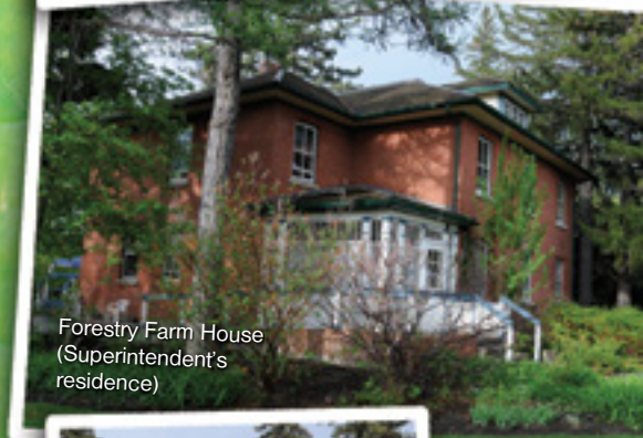
Forestry Farm House (Superintendent's residence)