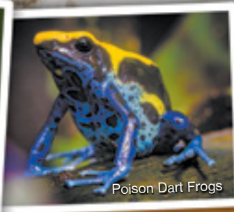
Poison Dart Frogs