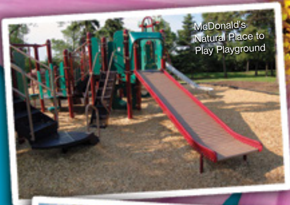
McDonald's Natural Place to Play Playground