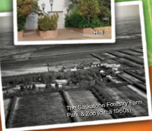
The Saskatoon Forestry Farm Park & Zoo (circa 1960s)