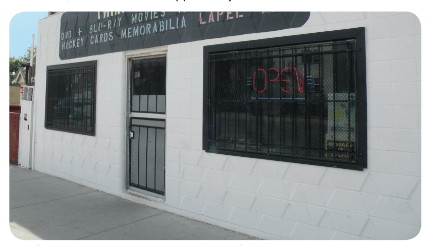
Storefront image contributes to the aesthetics of the street and neighbourhood

Properties and businesses that appear to be maintained and cared for suggest that inappropriate behaviour or criminal activity will not be tolerated and that care is being taken to protect the site. Tidy storefronts, building sites, and building passageways create a positive impression on clients and the general public. Timely repairs show pride of ownership, improve the image of the area, and decrease the opportunity for crime to occur.