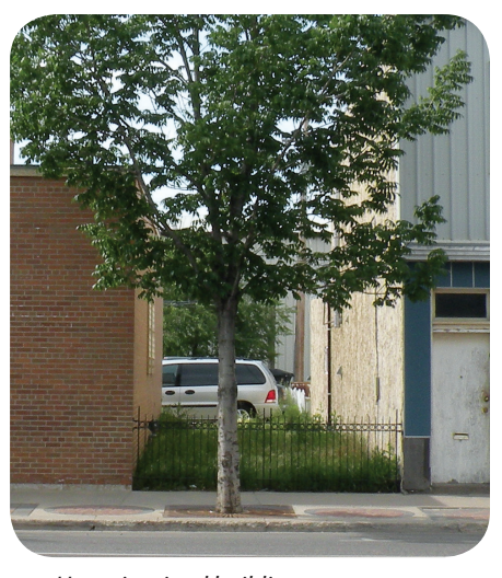
Unmaintained building passageways can be perceived as areas of higher risk

If you are reconfiguring or removing a recessed area you should pay particular attention to the architectural style of the building and the potential impact of the redevelopment on the overall look of the neighbourhood. Keep in mind the National Building Code