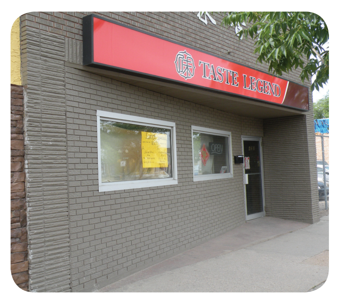
Reconfiguration of a recess can still offer an interesting building facade, which benefits the overall streetscape of an area