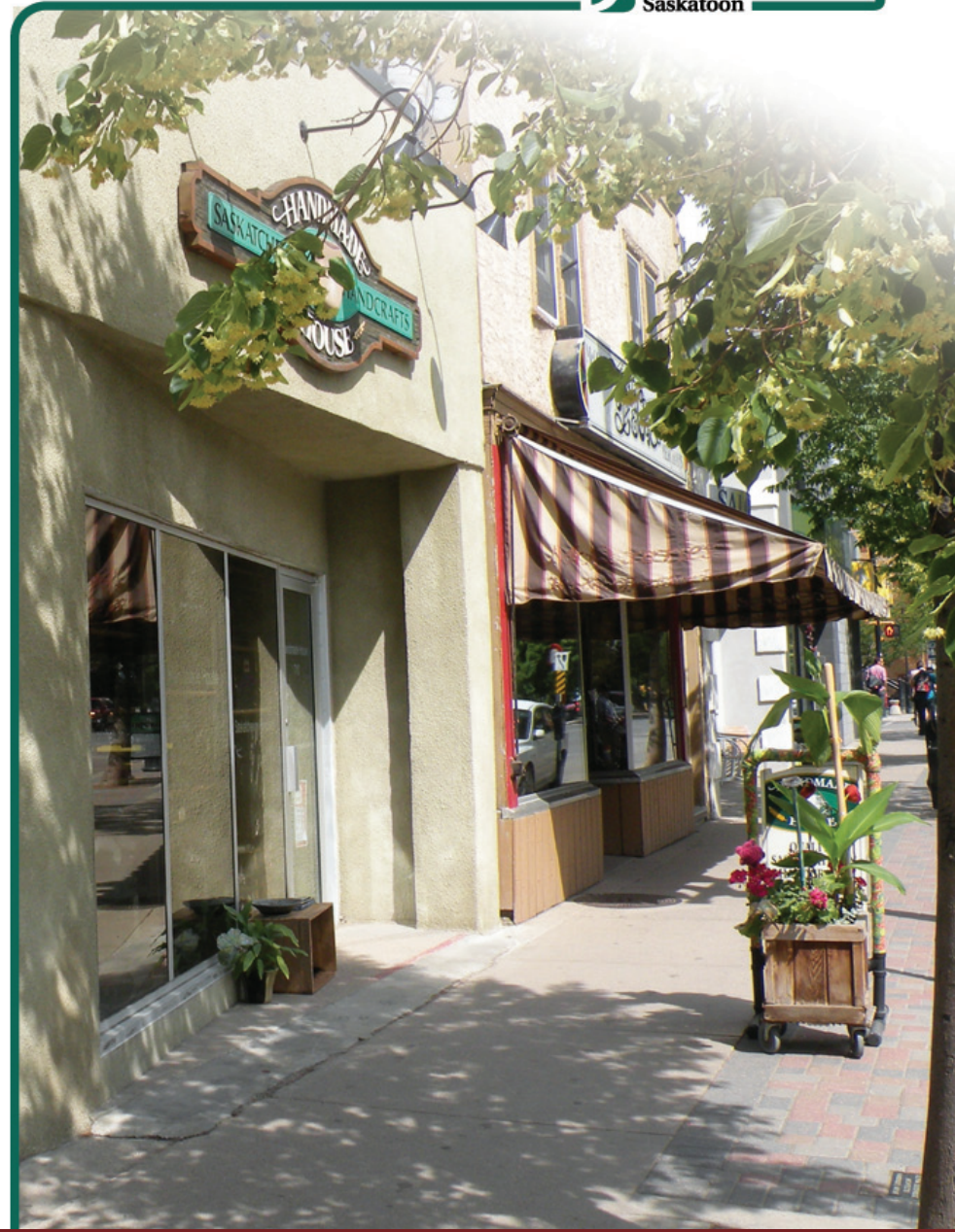
A Guide to Improving Recessed Doorways & Building Passageways