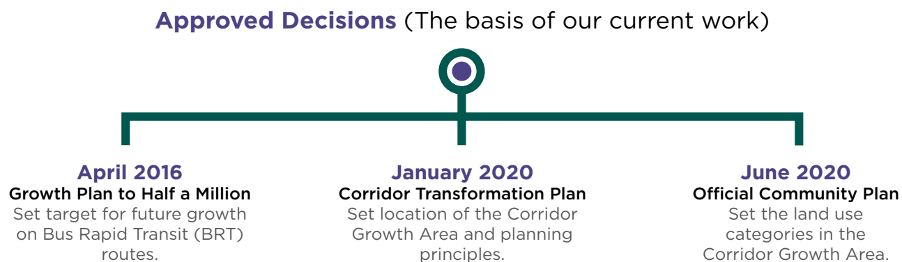
Figure 1: Foundational Decisions

The College Corridor Plan is the first corridor plan to be created by the City of Saskatoon (City) to guide future development along major streets, or corridors , in Saskatoon. The purpose of the Corridor Planning Program is to meet the City’s long-term vision for growth in areas along these corridors. This work is guided by the City’s overarching policy documents, including the Official Community Plan (OCP) , the Corridor Transformation Plan and the Growth Plan to Half a Million , and is aligned with the future Bus Rapid Transit (BRT) system (Figure 1). The College Corridor Plan focuses on a portion of land that follows College Drive from the South Saskatchewan River to Preston Avenue, as well as along Preston Avenue through University of Saskatchewan-owned lands from 14 th Street East to the Canadian Pacific Rail line.