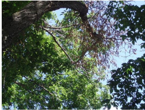
Elm tree with DED

Other things can cause wilting, flagging, yellowing leaves on elm trees including broken branches, insect damage, drought, root damage, and other diseases including Dothiorella wilt and Verticillium wilt.