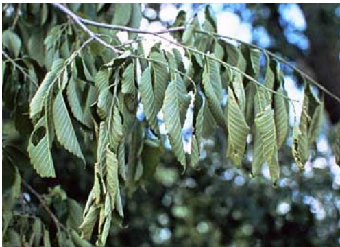
Wilting, drooping leaves (early stages)