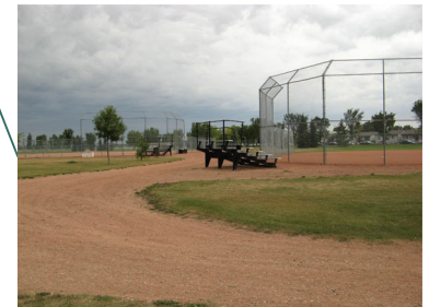
James Girgulis Park