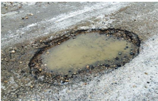
Example of an emergency pothole