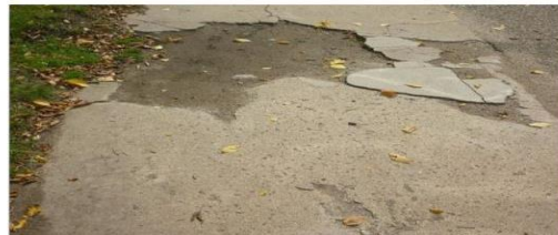
Example of damage requiring sidewalk an emergency replacement