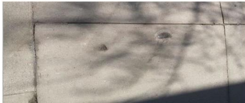
Example of sidewalk damage requiring a routine repair

To view more information about road maintenance services click on the images below to review their respective webpages at Saskatoon.ca.