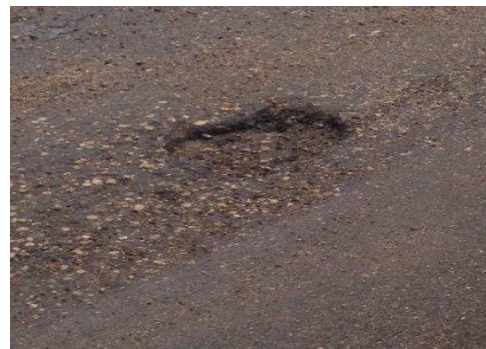
Example of a routine pothole