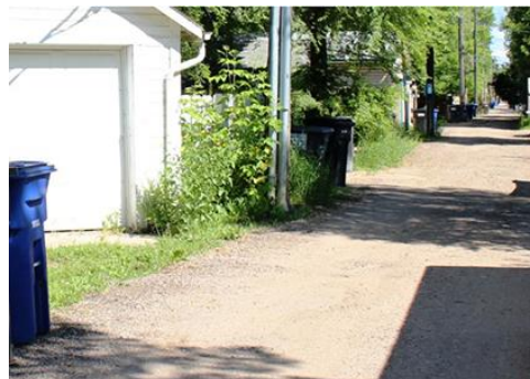
Example of a gravel back lane