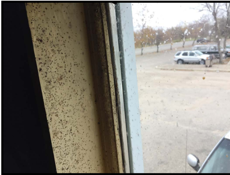
Photograph 1: Asbestos-Containing Black Interior Window Caulking.