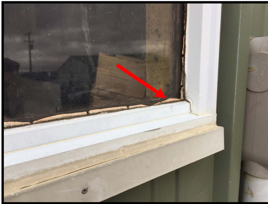
Photograph 2: Asbestos-Containing White Exterior Window Caulking.

\\golder\galledmonton\active\2016\3 proj\1667963 cityofsaskatoon_asbsurveys_saskatoon\07 reports\50 - holiday park golf course maintenance bldg\appendix b - hpgc mb - site photographs.docx