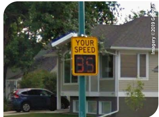
Figure 5.1 - Spadina Crescent East (North Park Neighbourhood)

Speed display boards are used as traffic calming devices in addition to or instead of physical devices.