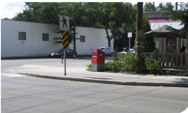
7th Avenue and Princess Street (City Park Neighbourhood)