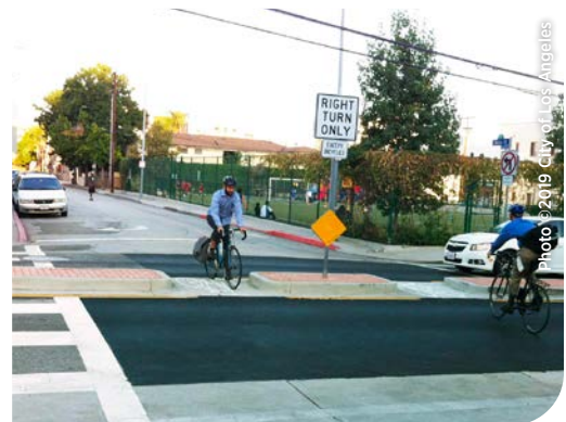
Figure 5.20 - Raised median through intersection

This measure should not be used across primary emergency access routes.