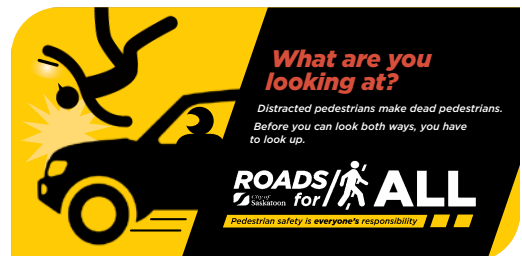
Figure 5.2 - “Roads for All” pedestrian safety campaign

Targeted education campaigns are initiatives to raise awareness of road safety issues. Education campaigns can be effective at changing attitudes and perceptions; however, the benefits may not result in lasting change.