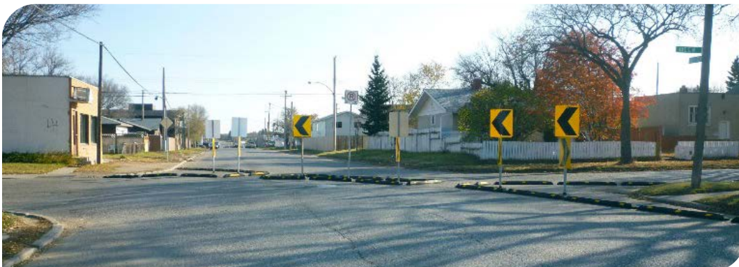
Figure 5.15 Avenue C and 38th Street - Temporary Device (Mayfair Neighbourhood)

The purpose of a diverter is to obstruct shortcutting or through traffic.