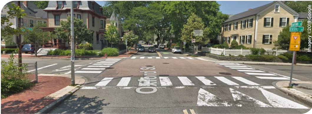
Figure 5.12 Raised intersection with raised crosswalks on Oxford Street in Cambridge, MA

The purpose of a raised intersection is to better define crosswalk areas; and the potential for a reduction in pedestrian-vehicle conflicts.