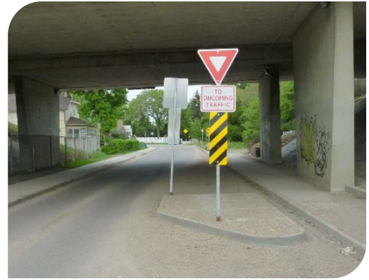
Figure 5.6 - Pinch Point on Saskatchewan Crescent (Nutana Neighbourhood) indicating that traffic must yield to oncoming traffic.

A choker is a curb extension at midblock or intersection corners that narrows a street by extending the sidewalk or widening the planting strip. It can leave the cross section with two narrow lanes or a single lane. Chokers are often referred to as pinch points, or midblock narrowing.