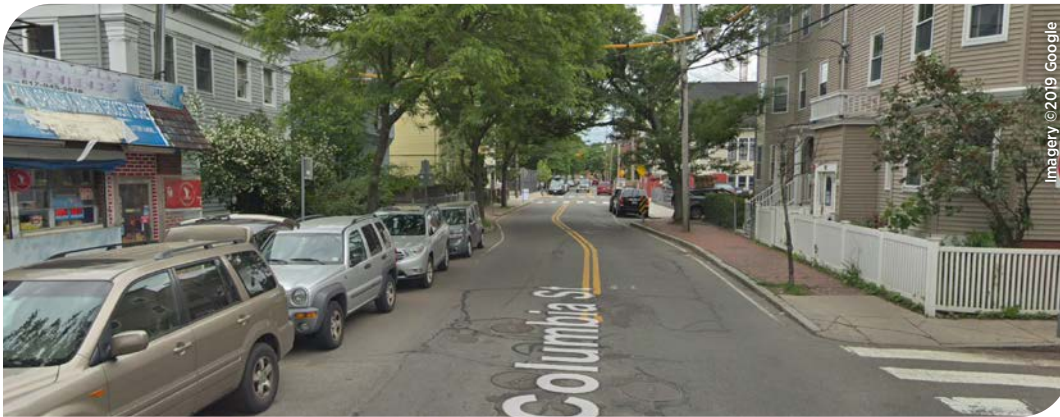
Figure 5.9 Lateral shift on Columbia Street in Cambridge, MA

A lateral shift involves the redesign of a straight section of road with pavement markings or curb extensions to create a curve in the road, similar to a chicane, which the driver must navigate around. A central island can also be used for a similar effect. The purpose of the lateral shift is to increase driver's awareness as they negotiate it. It can also be effective in reducing speeds.