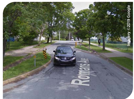
Figure 5.8 - Chicane on Romans Avenue in Halifax, NS

A one-lane chicane will discourage through traffic further, as it narrows a two-way road to less than a two-vehicle width. When vehicles traveling in the opposite direction meet at a chicane, one must yield to the other.