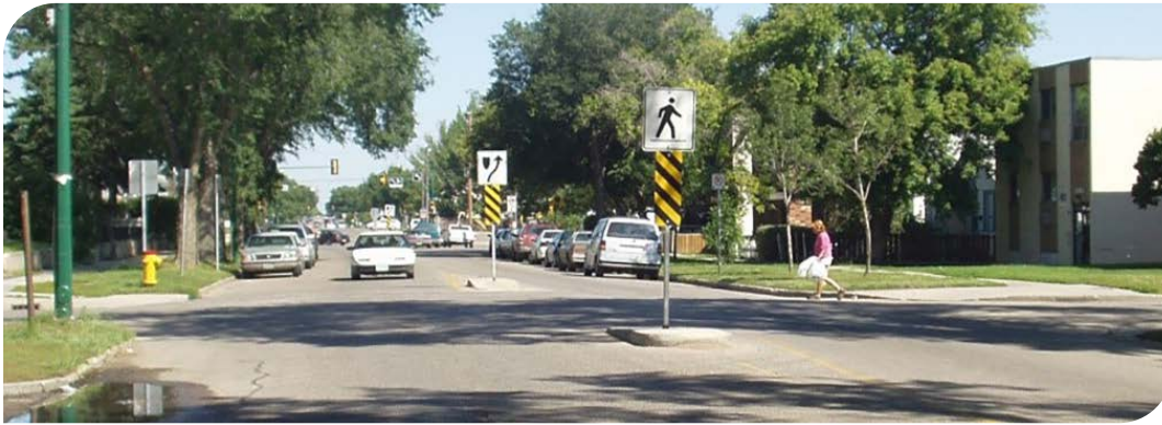
Figure 5.4 Avenue P and 21st Street (Pleasant Hill Neighbourhood)

Typically, raised median islands are designed using concrete and often have a mountable median tip. They are often 1.5 m in width.