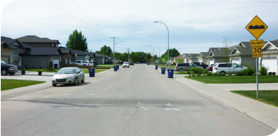
Figure 5.14 Speed Hump on Hughes Drive (Dundonald Neighbourhood)

A speed hump is a raised area of roadway that deflects both the wheels and frame of a traversing vehicle. Speed humps should only be considered if other traffic calming measures are not applicable or if there is excessive speed on a street.