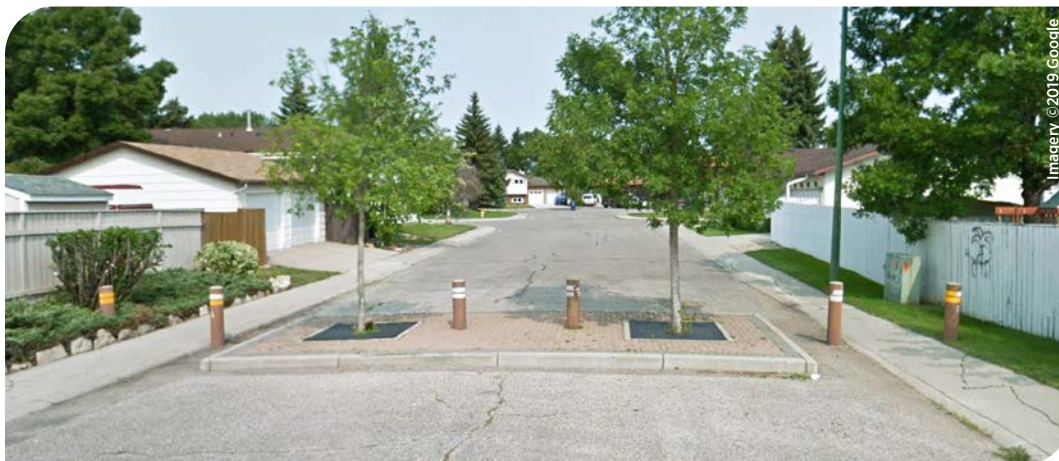
Figure 5.18 Coppermine Crescent and Churchill Drive (River Heights Neighbourhood)

Full closure is a barrier extending across the entire widths of a roadway that restricts all motor vehicle traffic movement from continuing along the roadway. The purpose of a full closure is to eliminate shortcutting or through traffic. It can be designed to allow pedestrian and cyclist access.