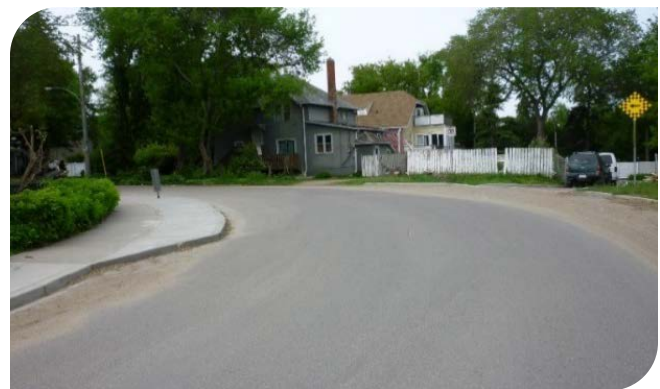
Saskatchewan Crescent (Nutana Neighbourhood)