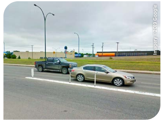
Figure 5.19 - Intersection channelization at 22nd Street and Fairmont Drive

The purpose of intersection channelization is to reduce conflict points, including vehicle-pedestrian conflicts and reduced crossing distance.