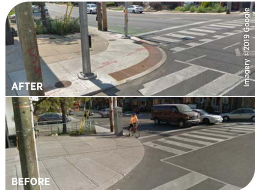
Figure 5.7 - Corner Radius Reduction on Davenport Rd. and Christie St. in Toronto, ON

The purpose of a reduced curb radius is to slow right-turning vehicles, reduce crossing distance for pedestrians, and improve pedestrian visibility.