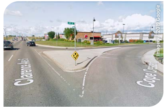
Figure 5.16 - Clarence Avenue and Cope Crescent (Stonebridge Neighbourhood)

A right-in/right-out island is a raised triangular island at an intersection approach. A right in/right-out island restricts left turns, and through movements to and from the intersecting street or driveway. The purpose of right-in-right-out island is to obstruct shortcutting or through traffic.