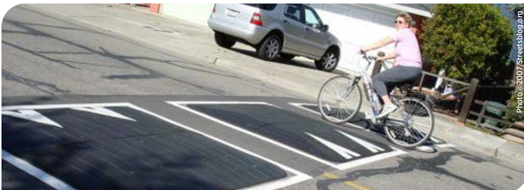
Figure 5.13 Speed cushion example on Bayview Drive in Alameda, CA

The design of a speed cushion forces cars to slow down as they ride with one or both wheels on the humps. However, the wider axle of emergency vehicles such as fire trucks and ambulances allows them to straddle the cushions without slowing down or increasing response times.