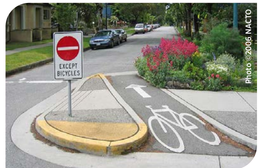
Figure 5.17 - Directional closure in Vancouver, BC

The purpose of a directional closure is to restrict shortcutting or through traffic.