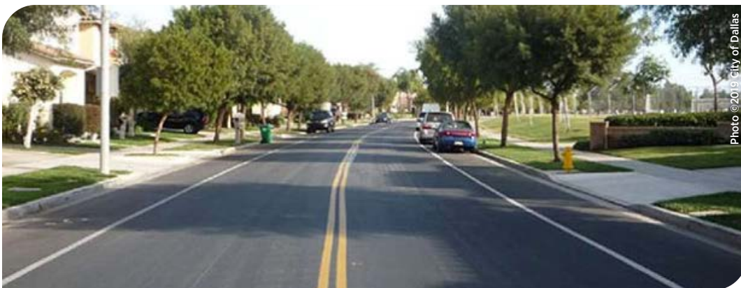
Figure 5.10 Lane narrowing using pavement markings

Lane narrowing pavement markings have a low cost but tend to have minimal effect as physical measures tend to provide better results.