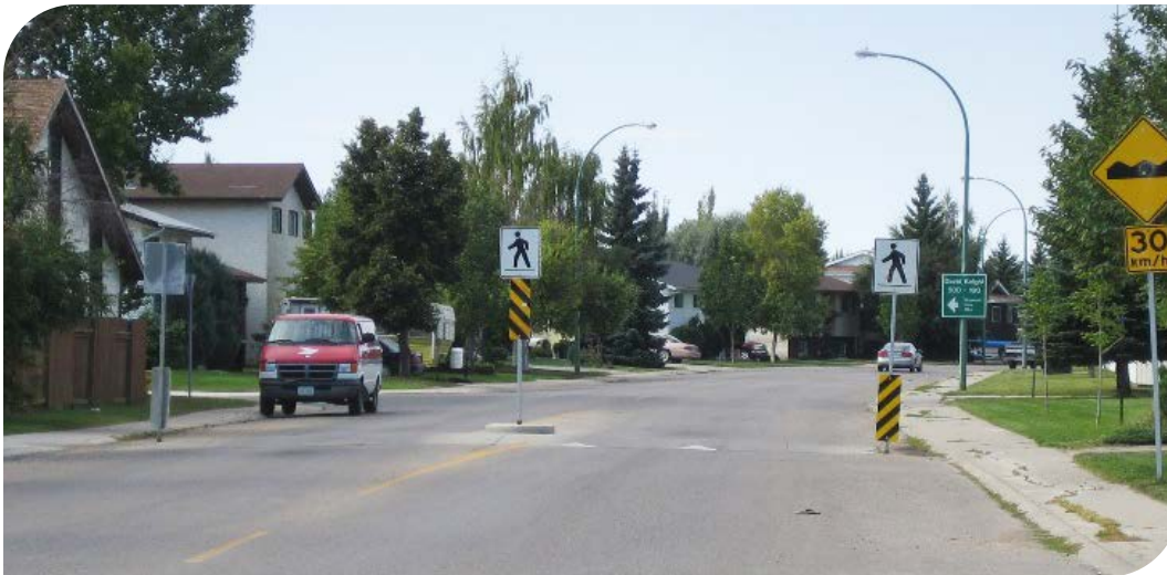
Figure 5.11 Meilicke Road between David Knight Crescent and Stechishin Crescent (Silverwood Heights Neighbourhood)

A raised crosswalk is a marked pedestrian crosswalk at an intersection or mid-block location constructed at a higher elevation than the adjacent roadway. Raised crosswalks may help reduce vehicle speeds and improve pedestrian visibility, thereby reducing pedestrian-vehicle conflicts.