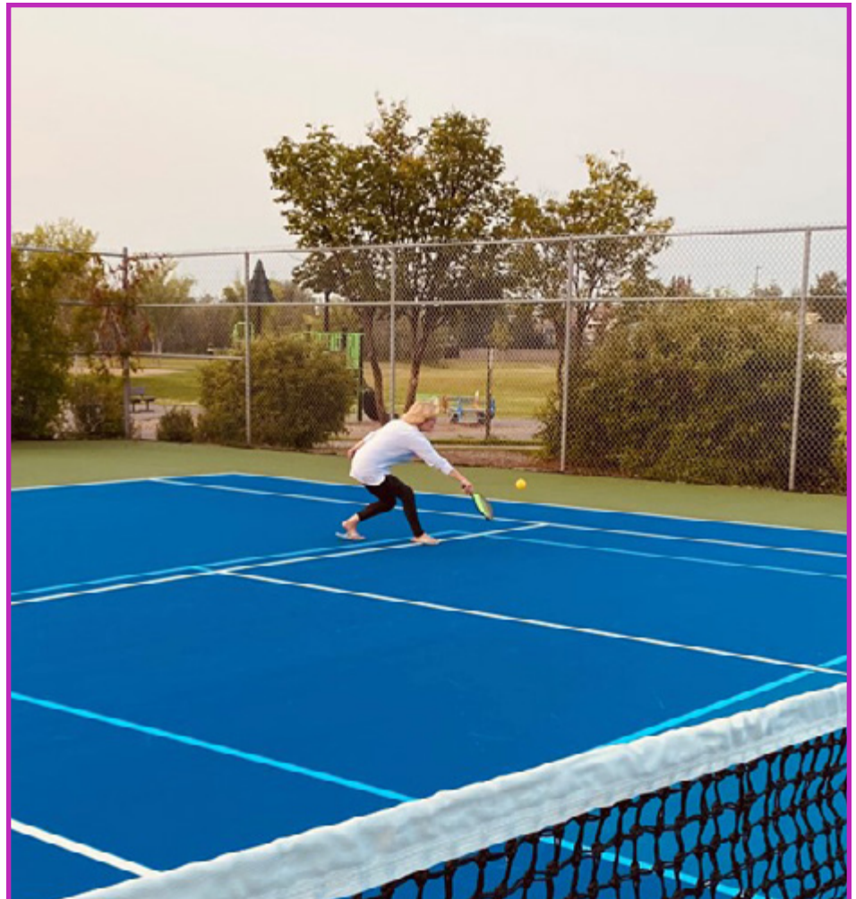
Above: Lakeridge Community Association's President plays first game of Pickleball on the newly opened hybrid courts in Crocus Park. Funding for this was through the Lakeridge Community Association