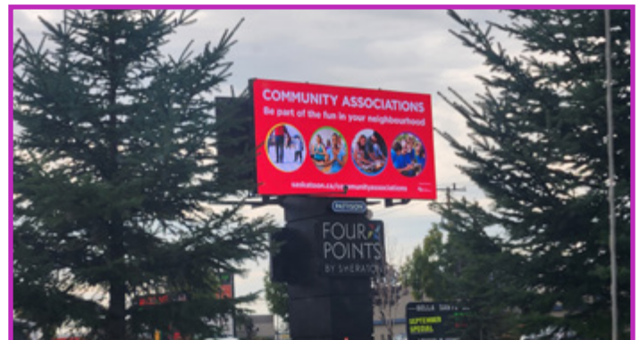
Above: Digital billboards can be seen around Saskatoon in fall.