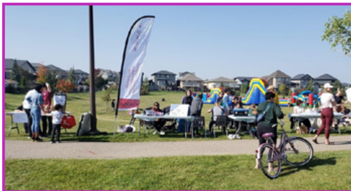
Above: Silverwood Heights and Willowgrove/University Heights display their banners at fun days in the park

In late 2022, the City of Saskatoon initiated a grant program for Community Associations to purchase branded promotional items with their logo – like a tablecloth or banner – to use at events and programs. In total, 31 out of 47 Associations took advantage of this program and purchased items.