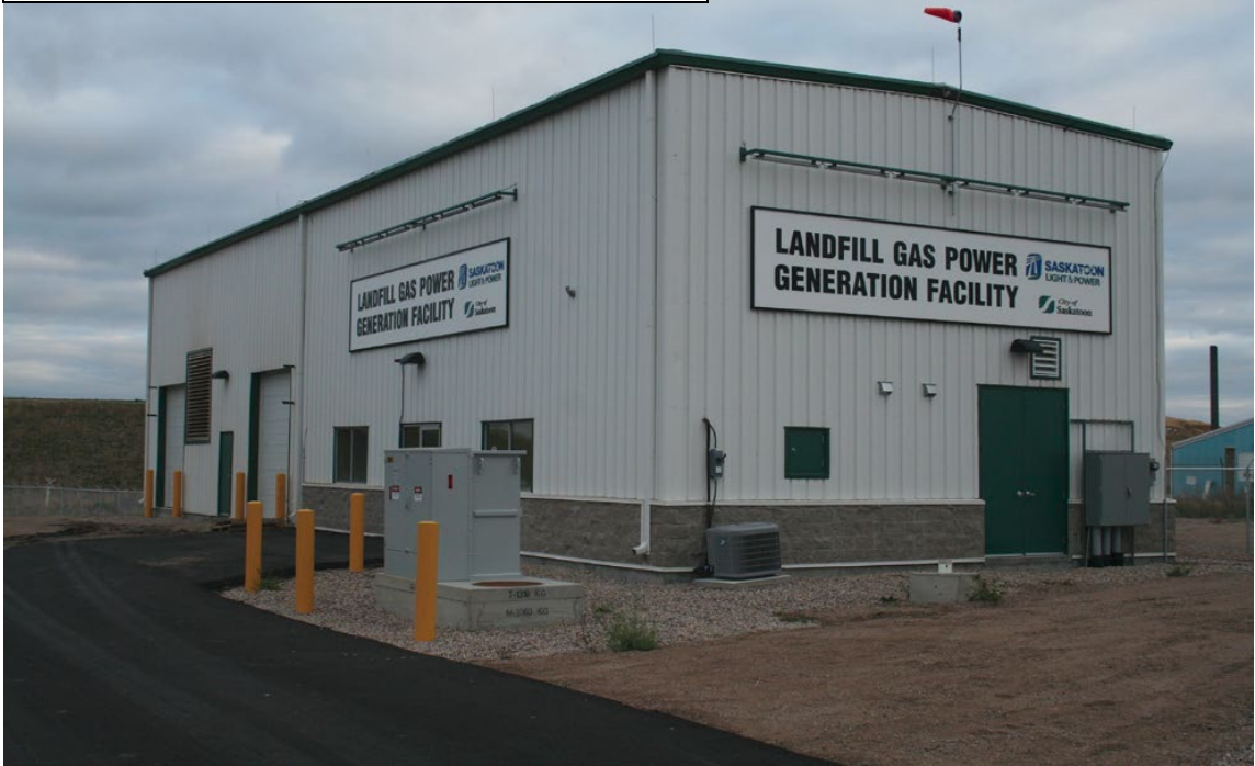
Landfill Gas Power Generation Building