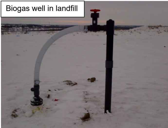
Biogas well in landfill